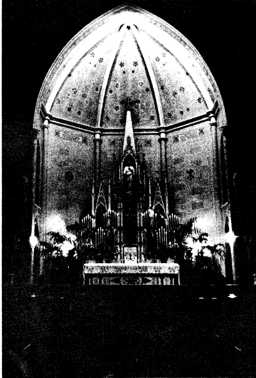
The St. Vincent Chapel, Christmas, 1934.