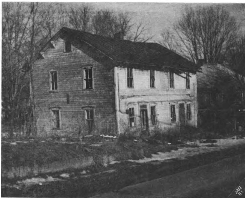
THE HOME OF THE ROSECRANS FAMILY HOMER, LICKING COUNTY, OHIO

197 EAST GAY STREET COLUMBUS, OHIO 43215