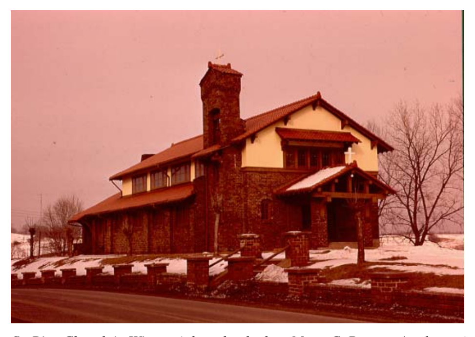
St. Pius Church in Winter