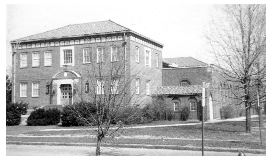
Rosary High School, looking east from Berkeley Road.

In 1943 Holy Rosary still had over 400 families, over 2,000 souls. There were 22 Sisters of St. Francis, three or four diocesan priests, and seven