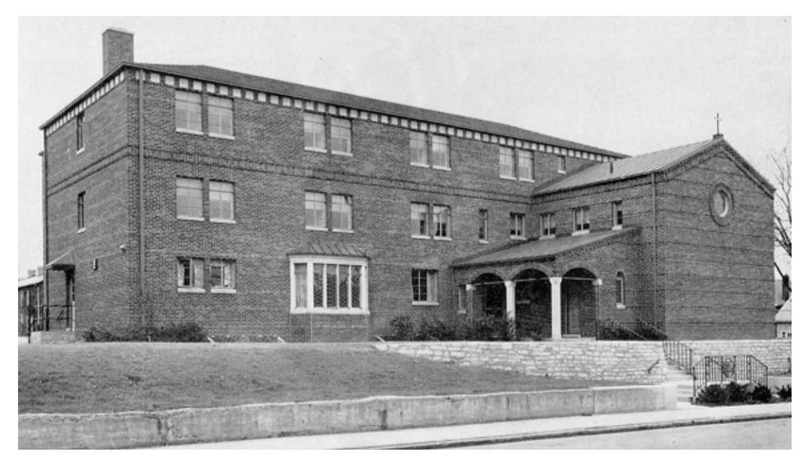
Holy Rosary Convent