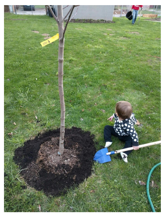
Involve your entire family in a tree planting project.

If the church or home is adjacent to or contains an urban forest or woods, connect the parish landscape with it. Maintain trees on church property, and if possible, mimic the nearby wooded property in the church landscape. Creating a corridor is essential for wildlife and bird migration and movement.